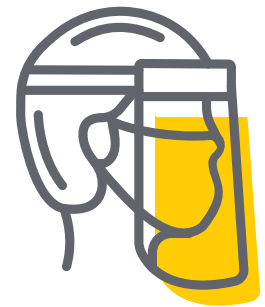
FACE SHIELD WORN WITH OTHER ACCEPTABLE MASK

*Note: we will have additional face masks available onsite for any attendee that requires one